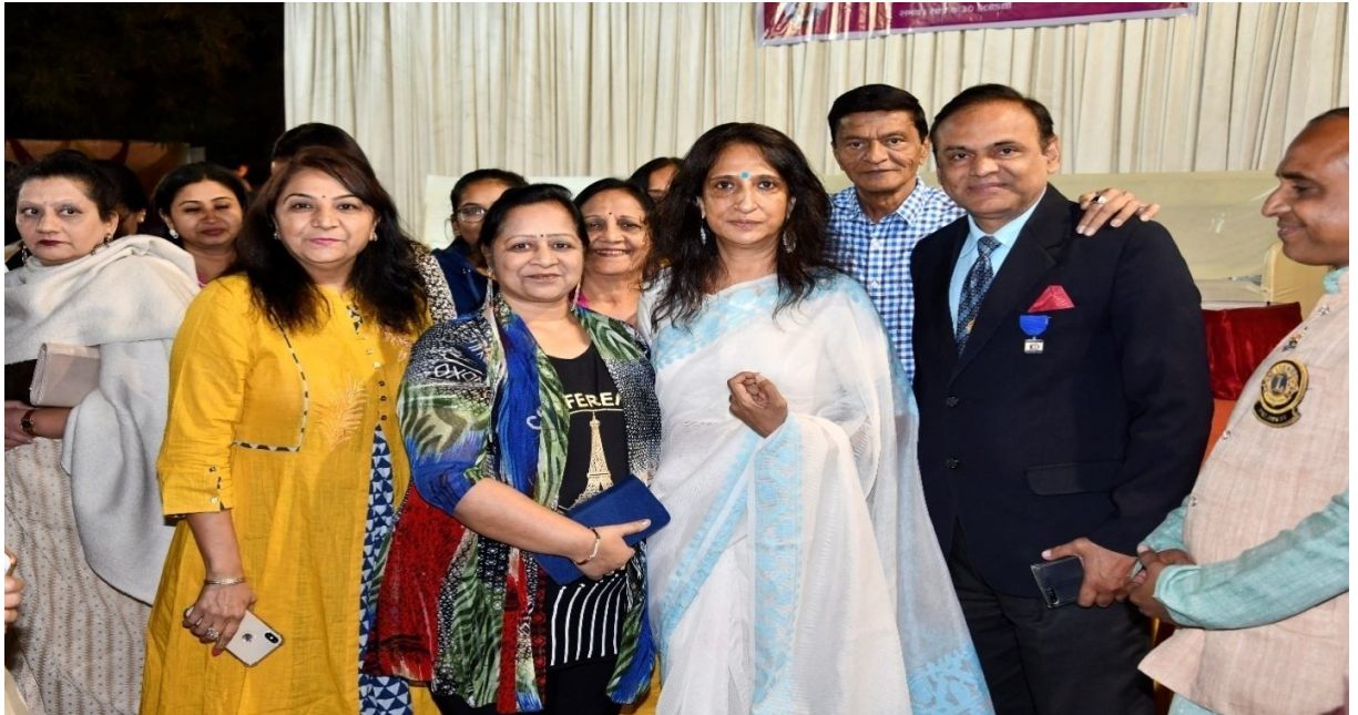
Photos of International Mother Tongue Day Celebration

Meetings : Tuesday / Saturday of the month at 8:00 p.m.